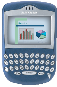
AFTER: View PowerPoint presentations with rich text, images, animation, and more!

Impatica for BlackBerry Enterprise Server converts Microsoft PowerPoint e-mail attachments into a compact format suitable for viewing on BlackBerry wireless handhelds. It consists of two components: